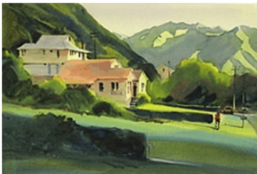
Manoa by Roger Whitlock

I have shown a couple of examples of Roger's amazing art but checkout his website www.rogerwhitlock.com for many more.